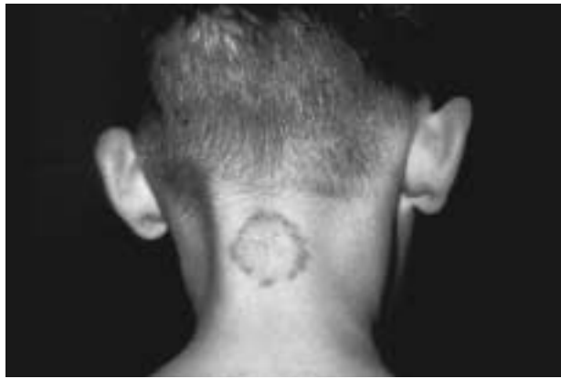
Fig 2 Typical ringworm lesion caused by Trichophyton tonsurans .