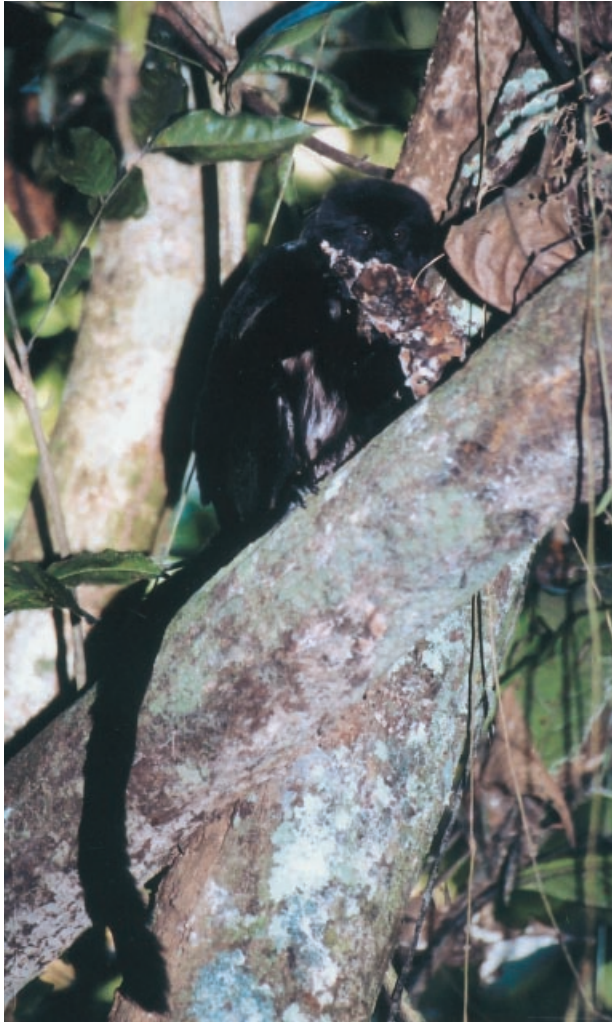
Fig 1 A wild Goeldi's monkey consuming an extremely large, dried specimen of Auricularia auricula in northwestern Bolivia. See also the front cover

sporocarps that are present. In fact, on a few occasions, the monkeys appeared to go 'mushroom hunting', travelling quickly and directly to places where sporocarps were likely to occur, such as bamboo patches and river-edge forest (A. Hanson, pers. obs.).