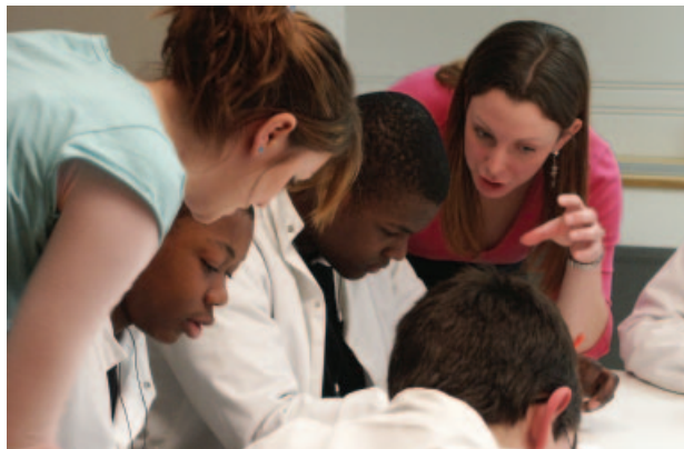
Teaching the 'Cells' package – up close and personal.