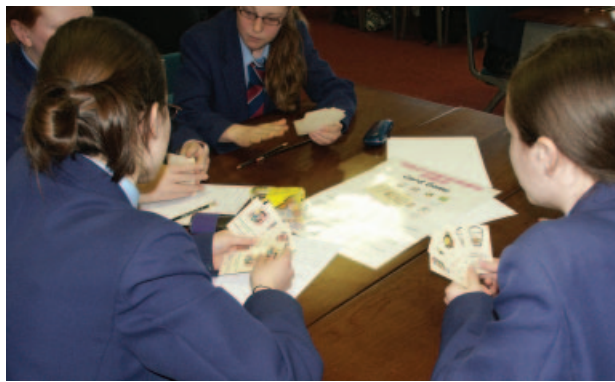
The 'What's your favourite fungus?' card school at a British Association Science Week event in Manchester. Strictly scientific! But strictly fun, too!