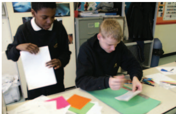
...and then enjoys creating a poster about it.