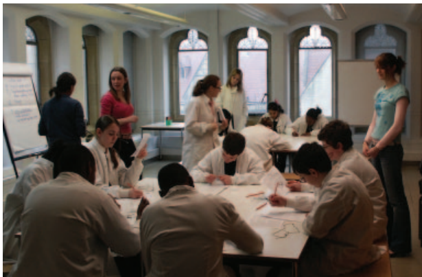
Teaching the 'Cells' package after a 'DNA workshop' in Manchester Museum.