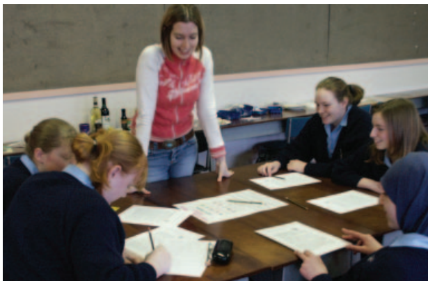
Pupils, especially girls, need to be encouraged to enjoy science and see its relevance to their everyday life.