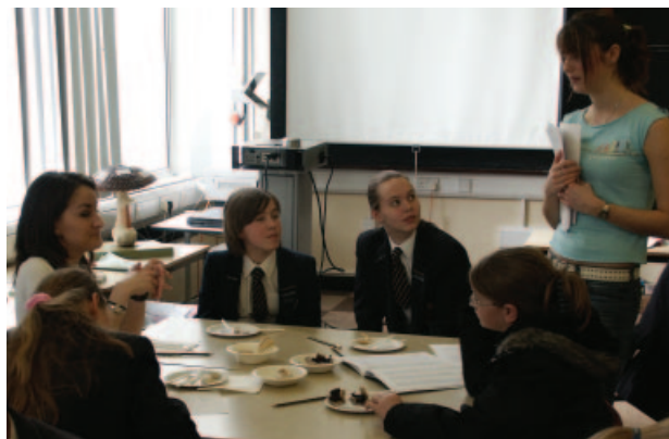
Mushroom structure can be taught with shop bought mushrooms but can lead into ideas about developmental biology, biodiversity, food science and commerce.