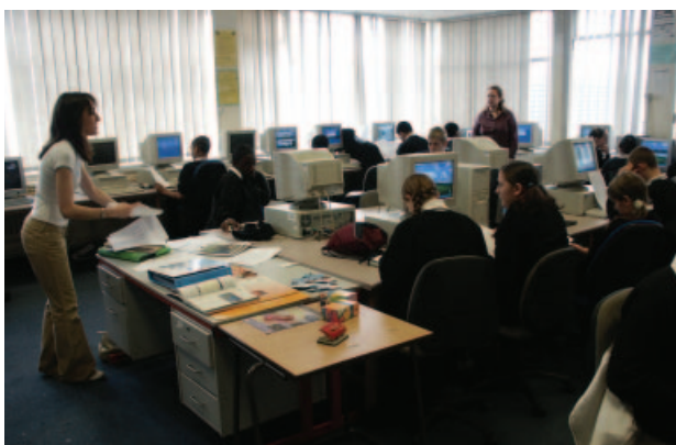
A year 10 class in an inner-city school in Manchester uses the Internet to find their favourite (or least-favourite) fungus ....