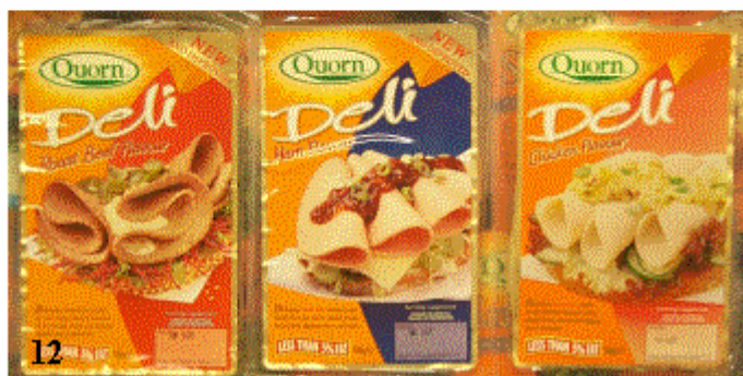
Figs 9 - 12. Point of sale. Fig. 9, supermarket mushrooms in Didsbury, Manchester. Fig. 10, selling mushrooms in Nathan Road, Hong Kong. Figs 11, 12. Fungi as food for sale in Manchester. Fig. 11, fresh Agaricus bisporus button mushrooms in their natural state. Fig. 12, three packs of Fusarium venenatum (previously called Fusarium graminearum ) pretending to be meat.