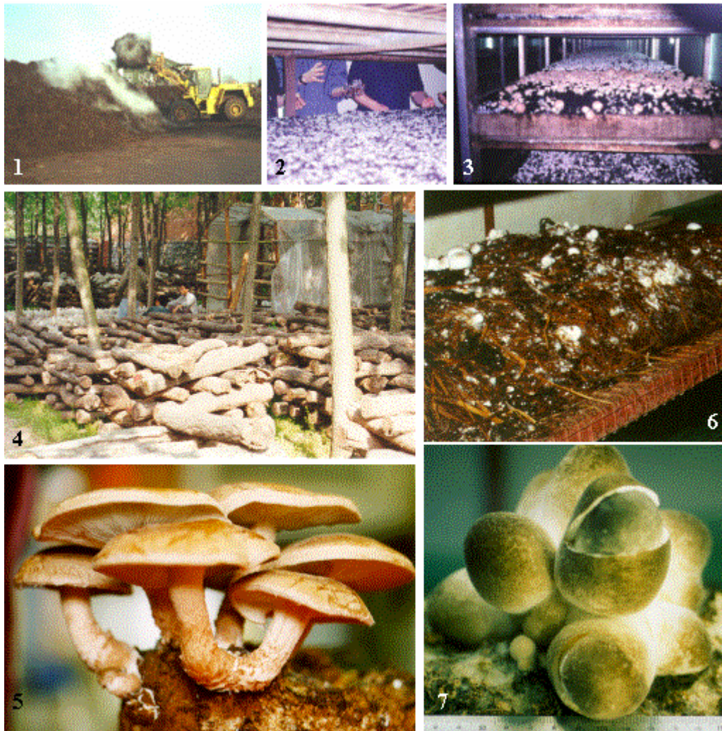
Figs 1 - 7. Mushroom production. Fig. 1 , turning the hot, steaming Agaricus compost. Fig. 2 , "... never mind the pins, feel the compost ..." it is considered very important for the farmer to feel the texture and moisture level of the compost. This sort of subjective judgement of the state of the compost is highly valued even though most of the environmental conditions (light, relative humidity, air temperature, compost temperature) for Agaricus cultivation are likely to be computer-controlled. Fig. 3 , the middle tray in a three-tier Agaricus growing house in Holland. Fig. 4 , an outdoor shiitake farm using natural wood logs in Hubei Province, China. Fig. 5 , Lentinula mushrooms fruited on an artificial log in the Department of Biology of the Chinese University of Hong Kong. Fig. 6 , Volvariella volvacea growing on rice straw. Fig. 7 , immature Volvariella 'eggs' grown on cotton waste compost (mixed with lime and wheat bran) in the Department of Biology of the Chinese University of Hong Kong.